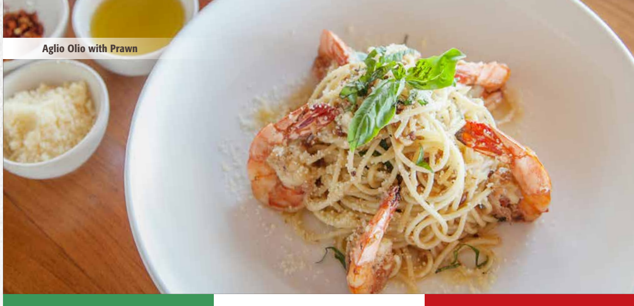
Aglio Olio with Prawn